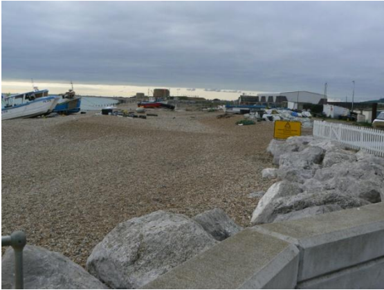
This short stretch of shingle beach leads to Martello Towers which mark the beginning of Hythe Ranges.