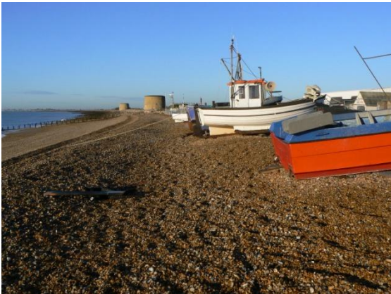
These ranges are busy and it is only possible to walk along the coast when firing is not taking place (on this case a Sunday). There is an easy clamber over a few rocks to a broad shingle track along the top of the sea defences.